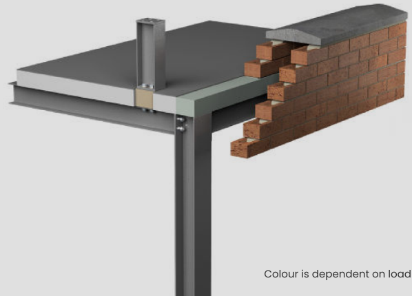
Colour is dependent on load

Roof to wall and parapet locations require structural framing for support which prevents continuous insulation from roof to facade. This creates a thermal bridge which can be prevented by providing an Armatherm™ 500 series structural thermal break under the parapet connecting the facade and roof insulation and improving the effective R value by as much as 30%. A thermal break can also be installed within the envelope at roof penetration points where structural elements are supported. This provides continuous insulation and prevents potential condensation issues.