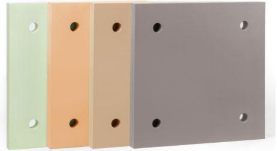
Armatherm™ 500 Series

Armatherm™ 500 is a high strength, polyurethane material made in several densities to support a wide range of loading conditions. Due to its closed cell structure, it does not absorb water or moisture and has limited creep under continuous load.