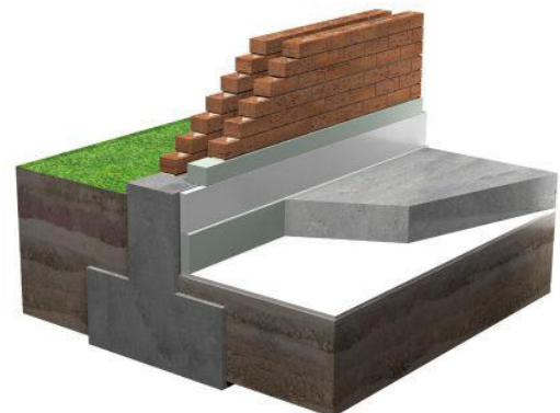
Colour is dependent on load

Foundations are part of a building's envelope. The connection from slab on grade to foundation wall and wall above foundation wall are both areas where thermal bridging occurs. Armatherm™ 500 series material can support and transfer loads up to 18.5 N/mm 2 while providing minimal energy loss.